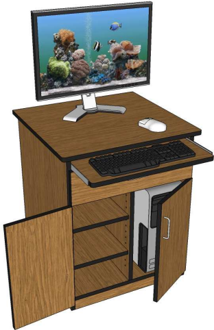
2-door, 1-drawer Computer Cabinet