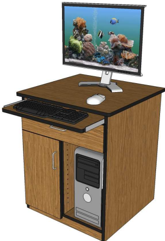
1-door, 1-drawer Computer Cabinet