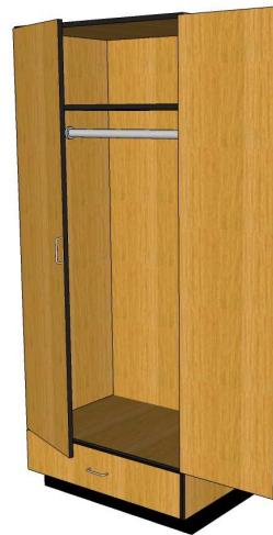
2-door, 1-drawer Wardrobe

WxHxD 48x84x23 36x84x23 48x72x23 36x72x23