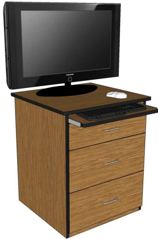
3-drawer Dresser with Keyboard Drawer