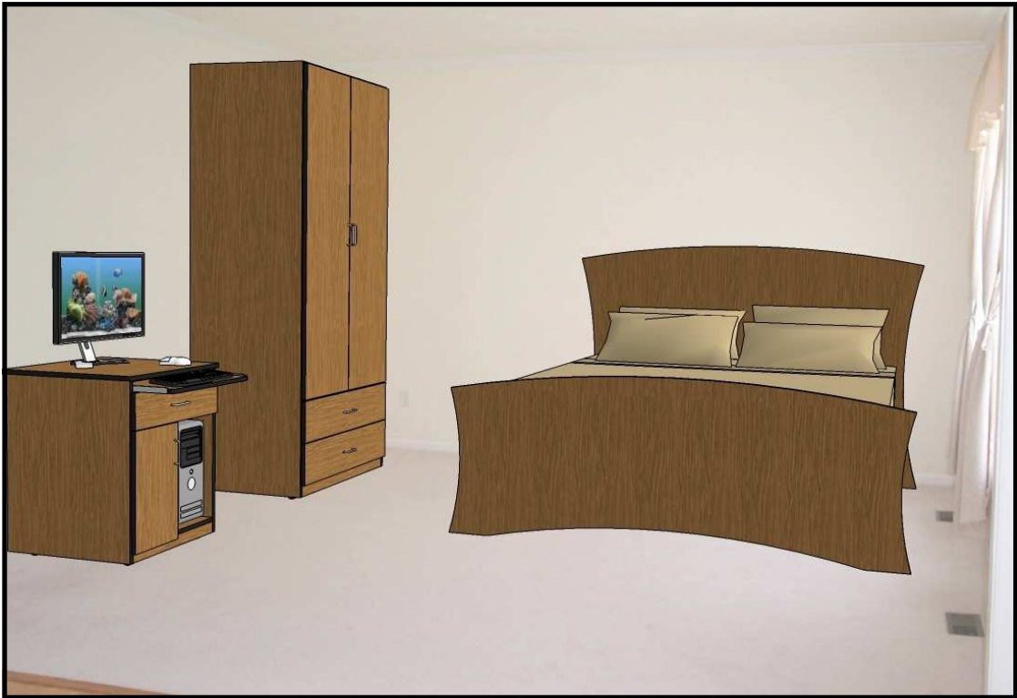
Above: Sample room layout using pieces from our SeniorCare line.