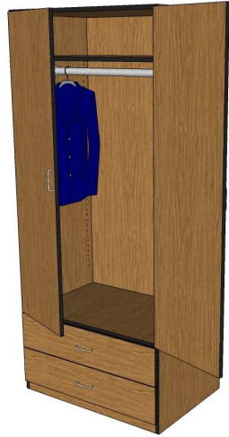
2-door, 2-drawer Wardrobe